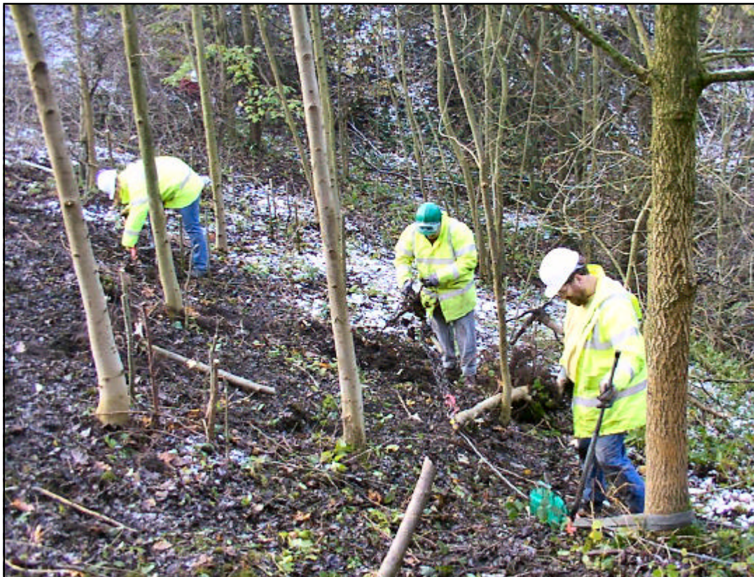
Stump pulling on the embankment