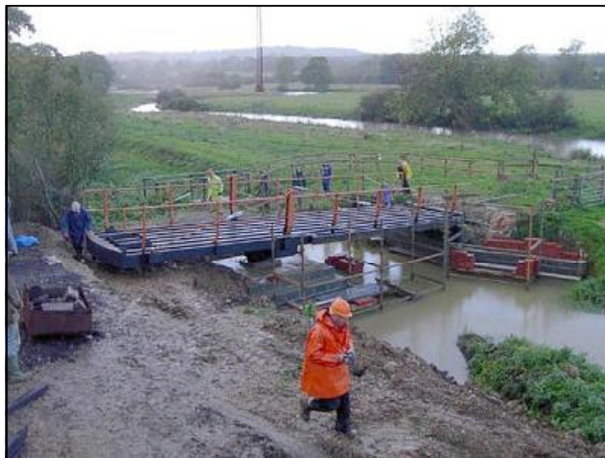
Haybarn swing bridge in position, site still above waterlevel despite the rain!