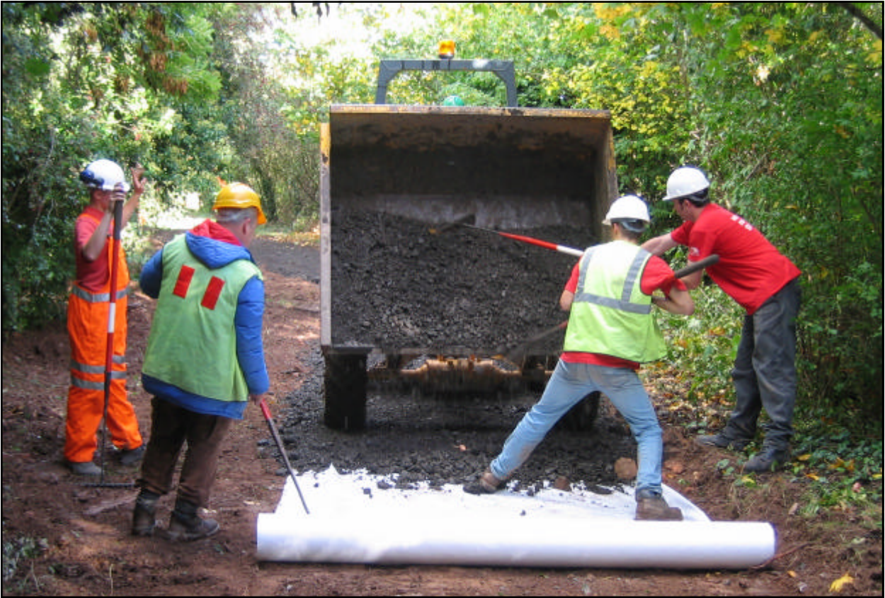
Cycleway laying on the H&G