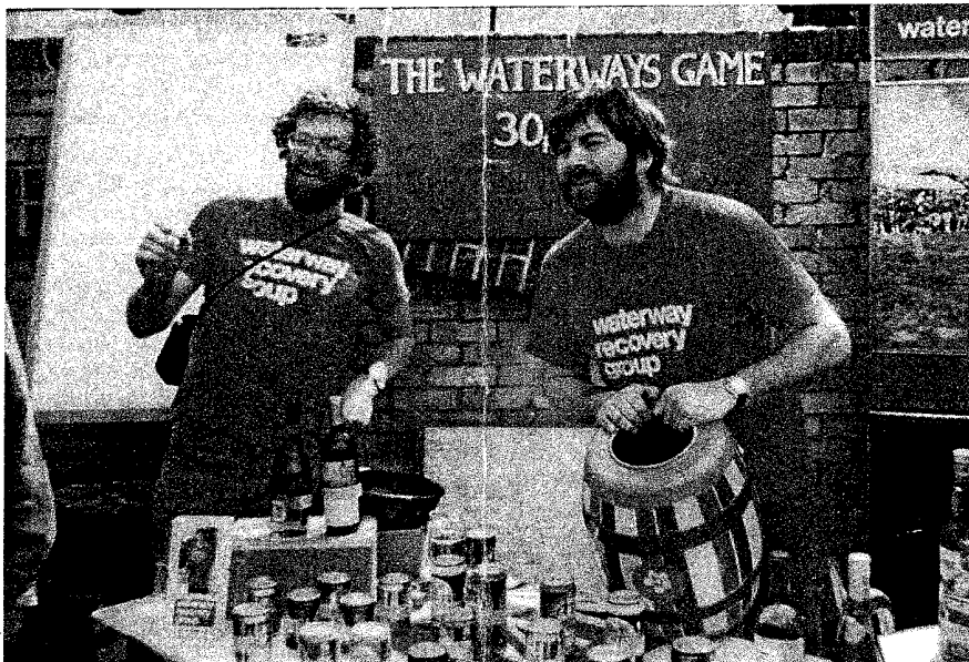
The Editor & the WRG Chairman combine their efforts to raise money for the IWA Golden Jubilee Appeal at Little Venice.

Other Events: in addition to the boat trip on June 26th (see p 3) we hope to organise some of the things suggested at the AGM, which included a barbecue, slide show, day trip to France and brewery tour. Details next time.