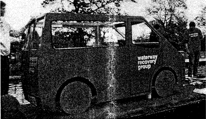
Above: Applying the final touches to our entry for Cavalcade (see page 7). Below: Moredon Aqueduct, N. Wilts Canal: rebuilding the north side arch faces (see report on page 4)